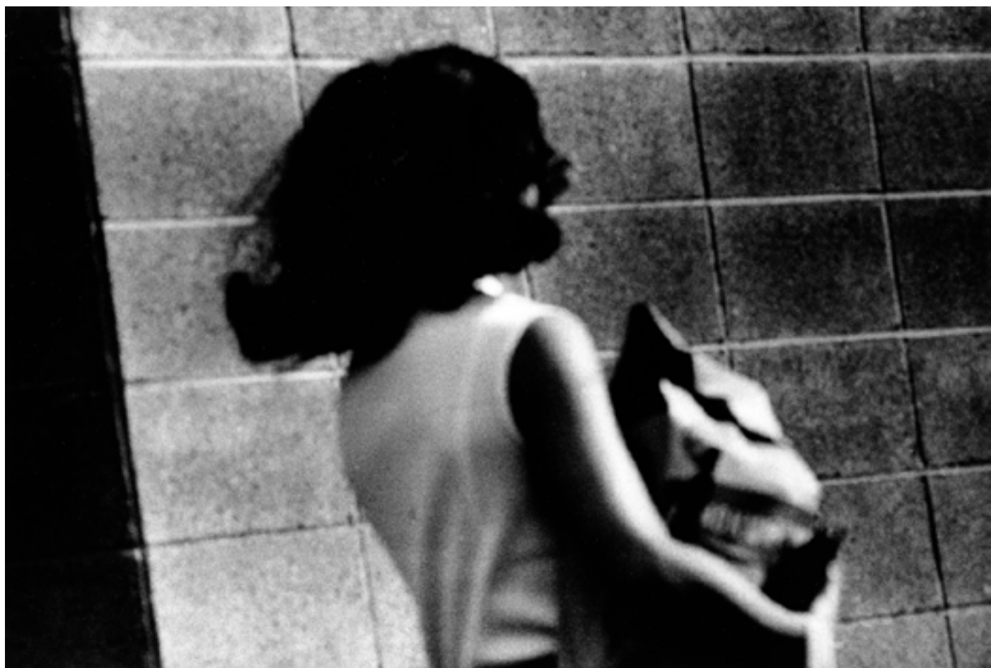
Daido Moriyama 457x560 mm paper size signed and dated