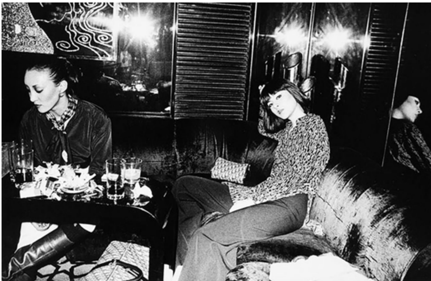
Daido Moriyama 356 x 432mm paper size signed and dated