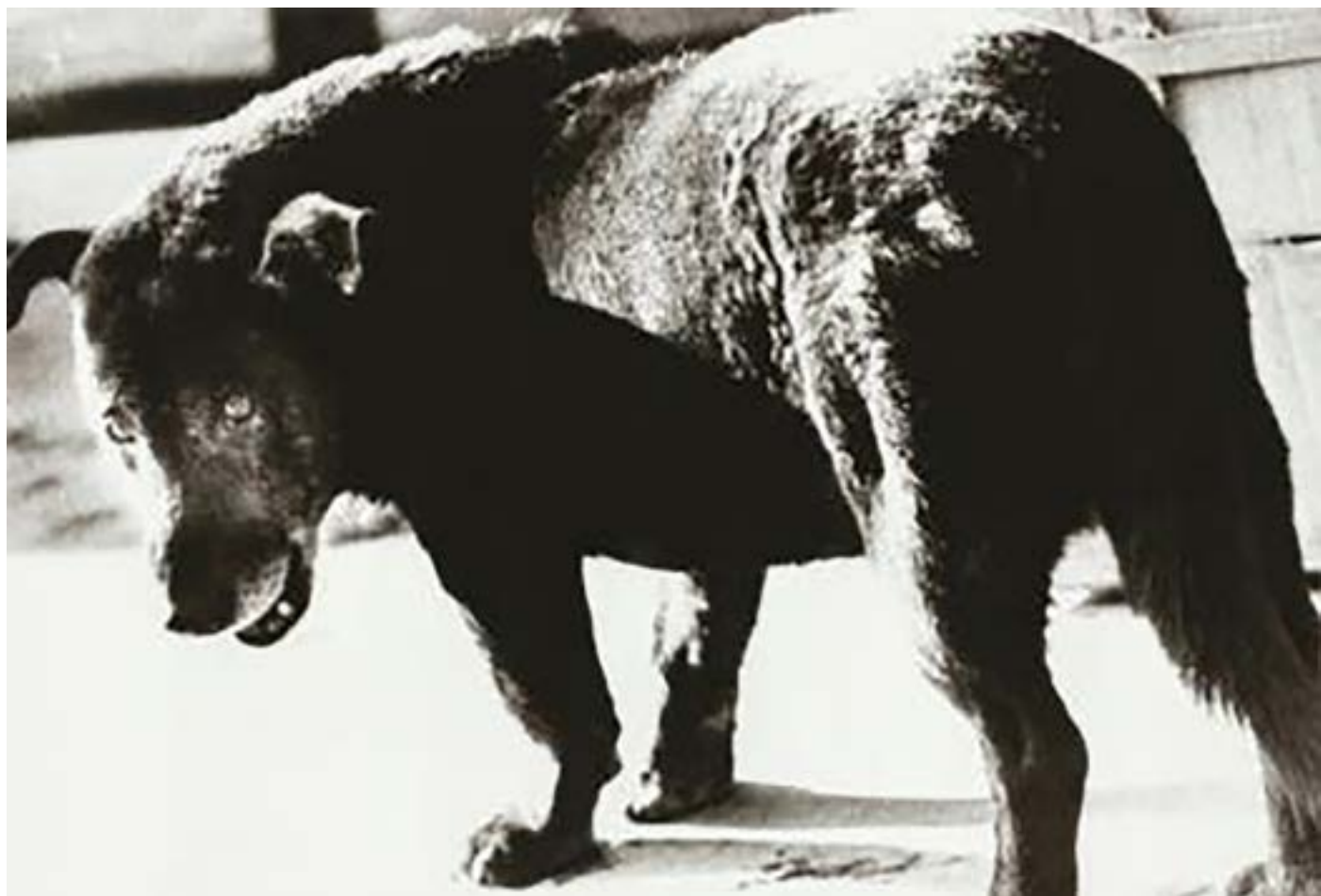
Daido Moriyama 457x560 mm paper size signed and dated