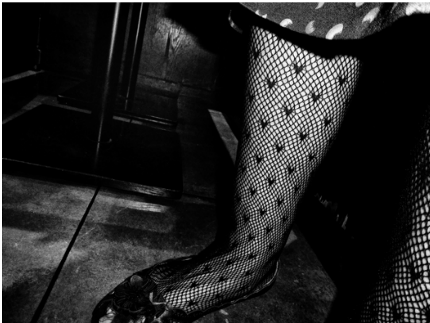
Daido Moriyama 254 x 305mm paper size signed and dated