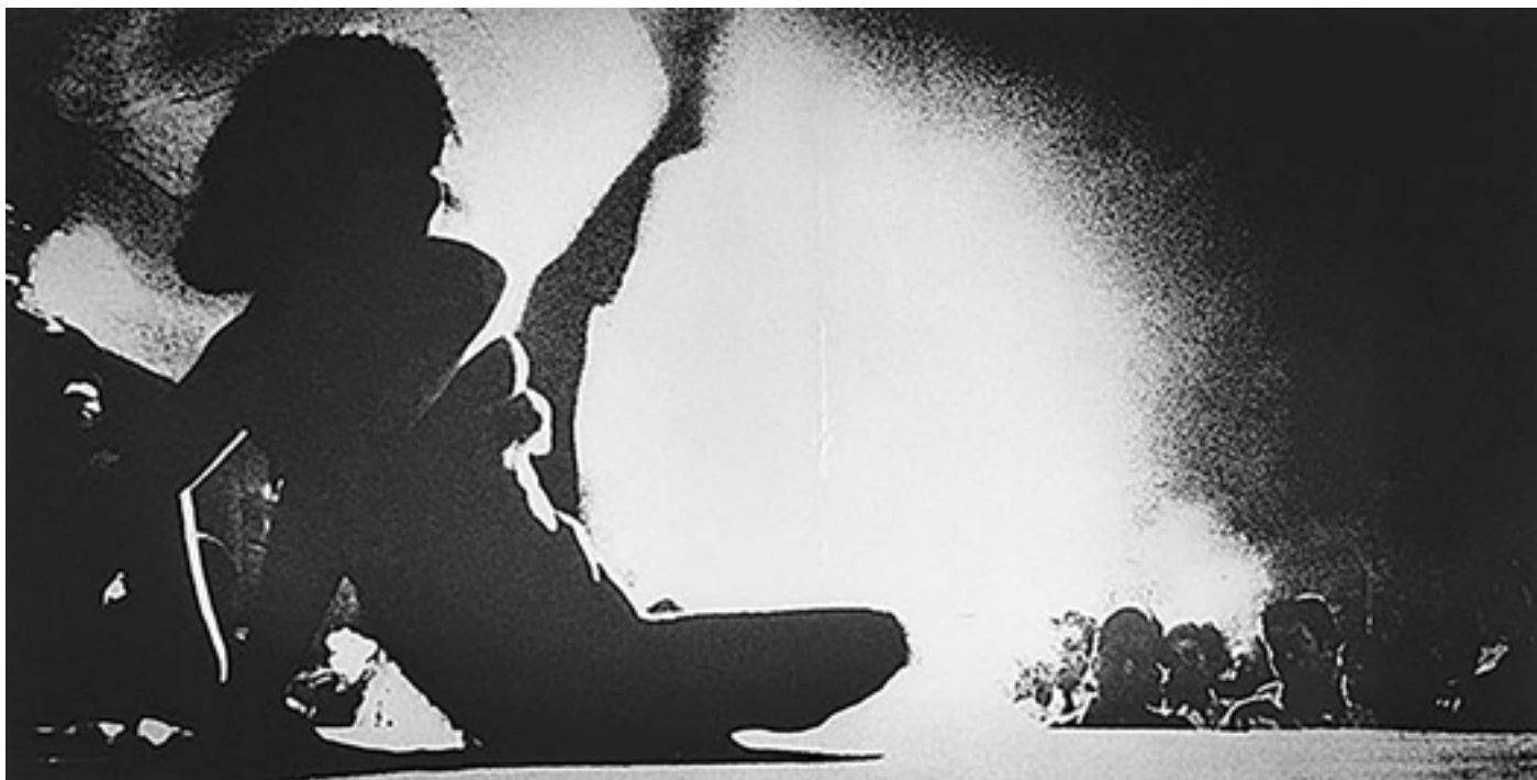
Daido Moriyama 254 x 305mm paper size signed and dated