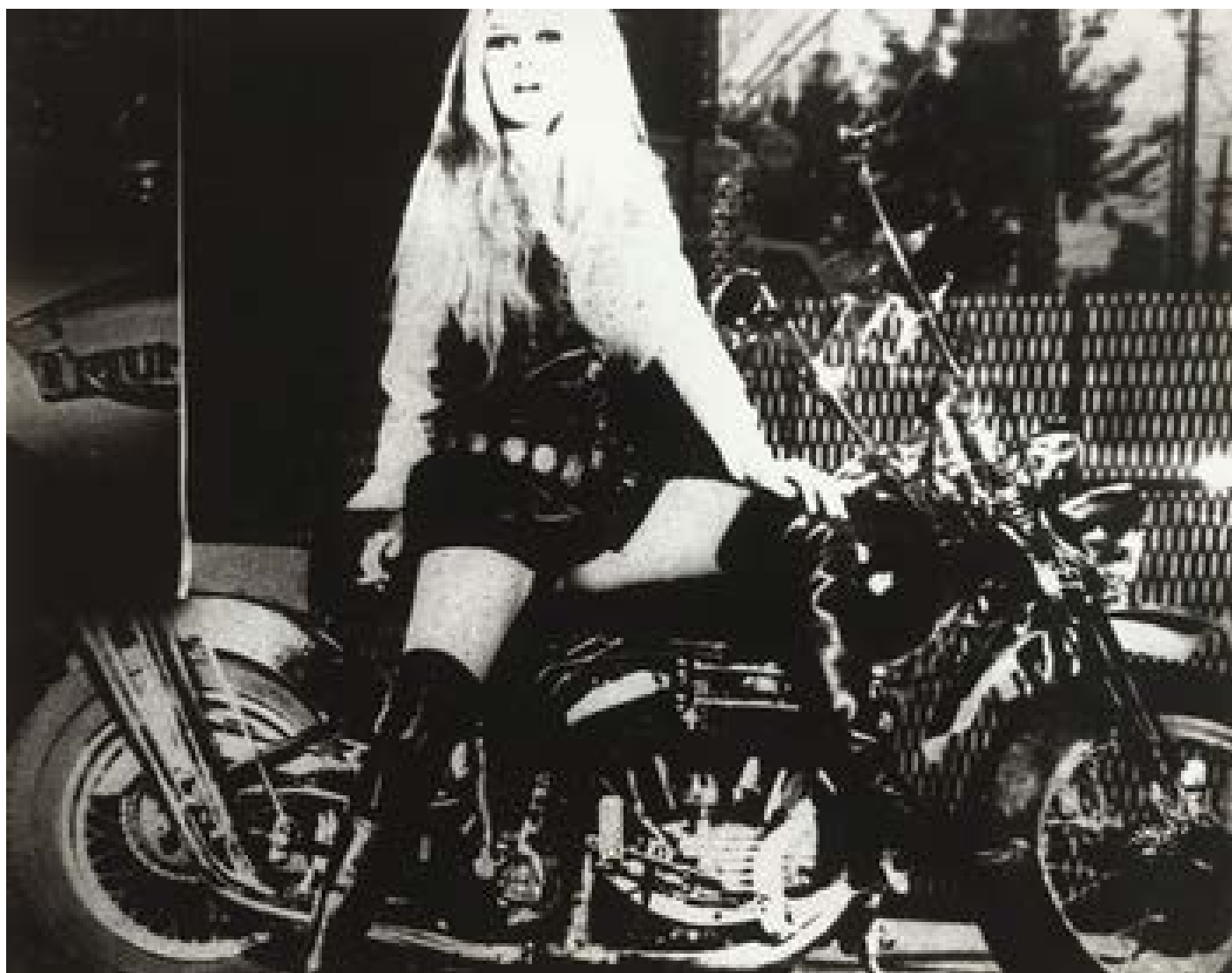
Daido Moriyama 356 x 432mm paper size signed and dated