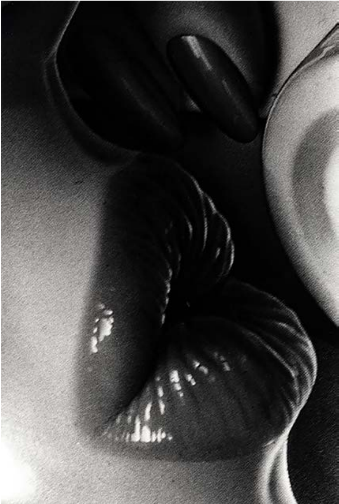
Daido Moriyama 457x560 mm paper size signed and dated