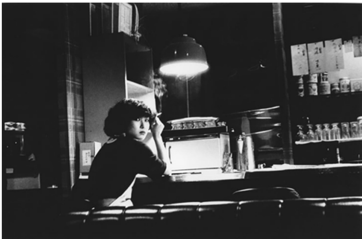
Daido Moriyama 457x560 mm paper size signed and dated