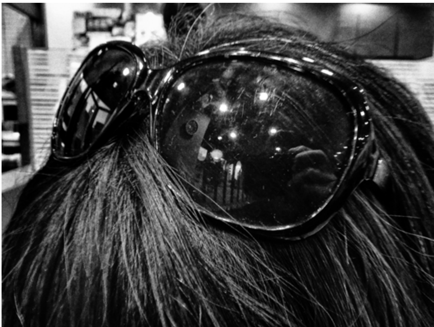
Daido Moriyama 254 x 305mm paper size signed and dated