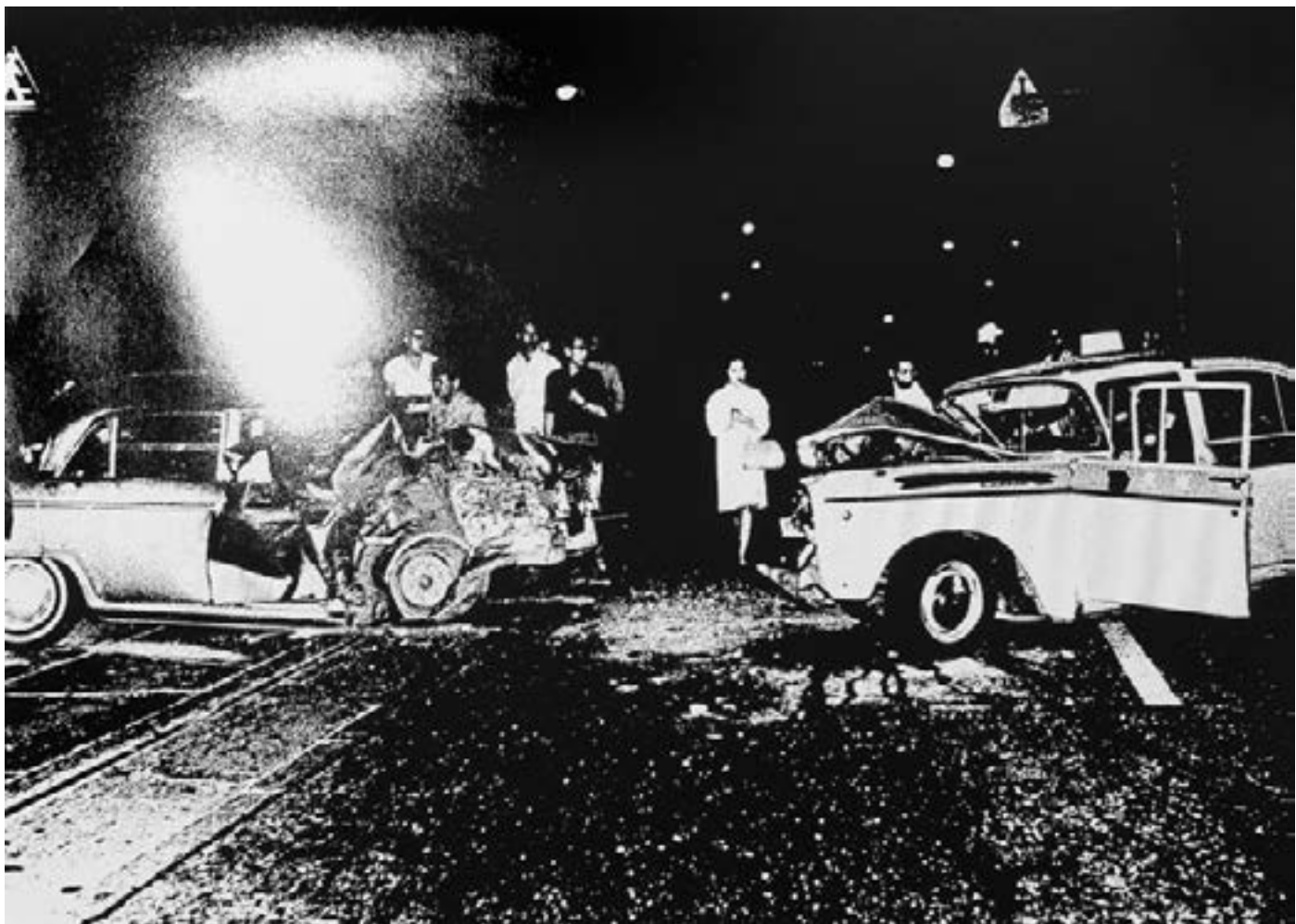
Daido Moriyama 457x560 mm paper size signed and dated