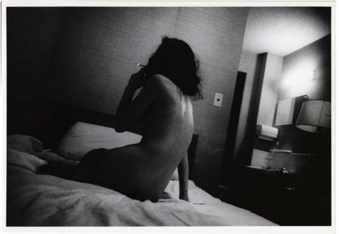
Daido Moriyama 457x560 mm paper size signed and dated