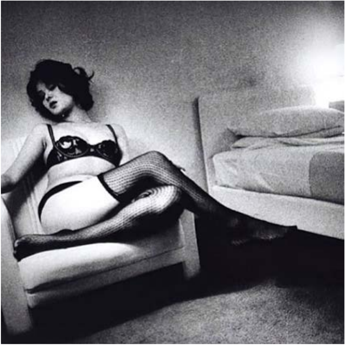
Daido Moriyama 254 x 305mm paper size signed and dated