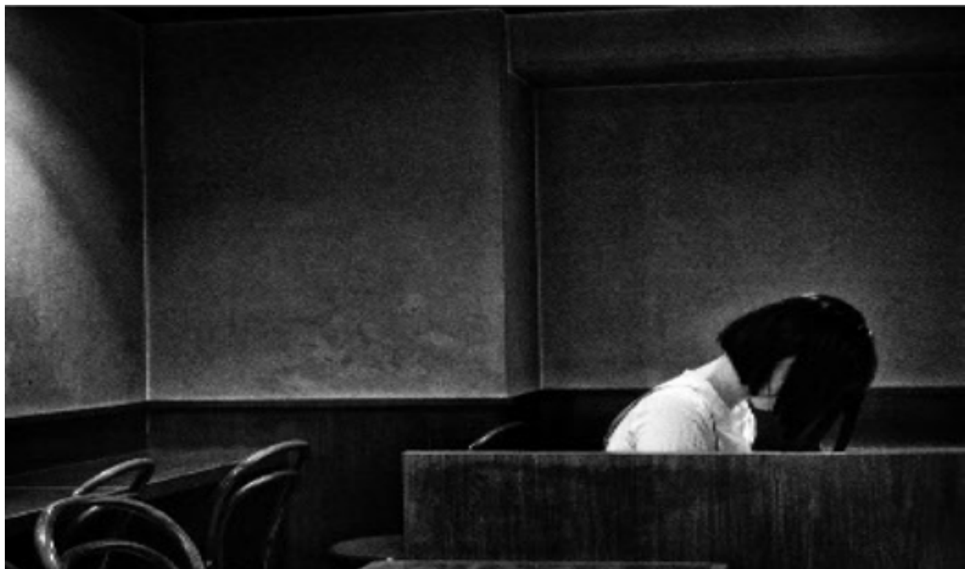
Daido Moriyama 457x560 mm paper size signed and dated