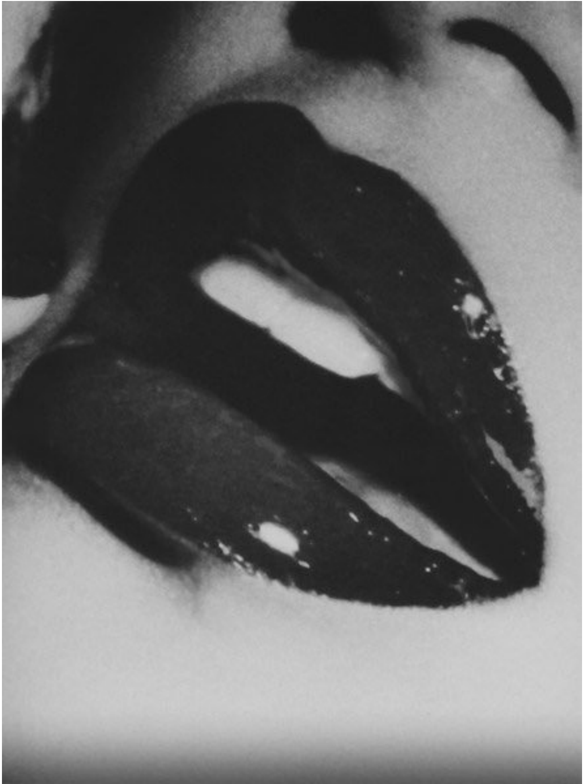
Daido Moriyama 457x560 mm paper size signed and dated