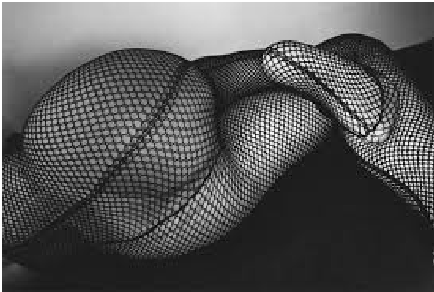
Daido Moriyama 457x560 mm paper size signed and dated